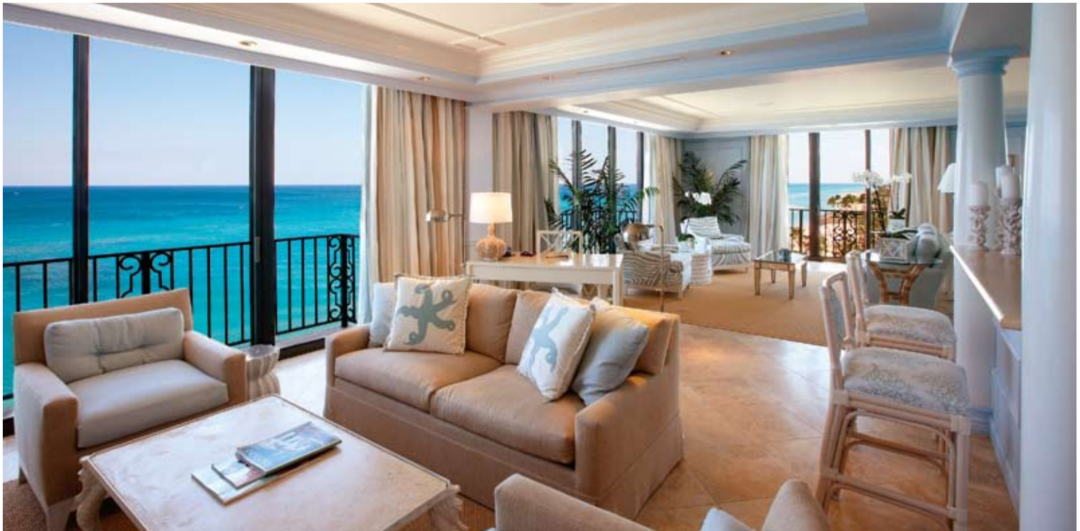
With a multi-million dollar renovation and its gorgeous views of the Atlantic Ocean, the Breakers in Palm Beach shared top U.S. beach resort honors.