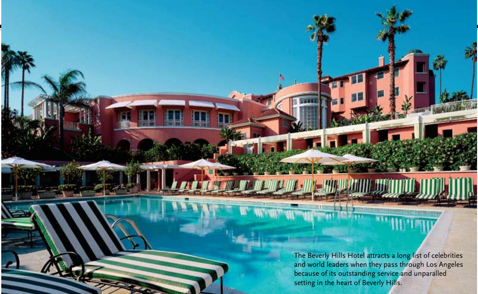
The Beverly Hills Hotel attracts a long list of celebrities and world leaders when they pass through Los Angeles because of its outstanding service and unparalleled setting in the heart of Beverly Hills.

Thailand, Indonesia, Vietnam and the South Pacific. South America is the other hotbed of new discoveries. For more than a decade, industry pundits have predicted the continent's emergence as vacation destination and this finally seems to be happening with wonderful lodging properties in every shape and size, from city hotels to tiny boutique lodges, tucked amongst historic city centers, ruins, mountains and rainforests, along with lavish golf and beach resorts.