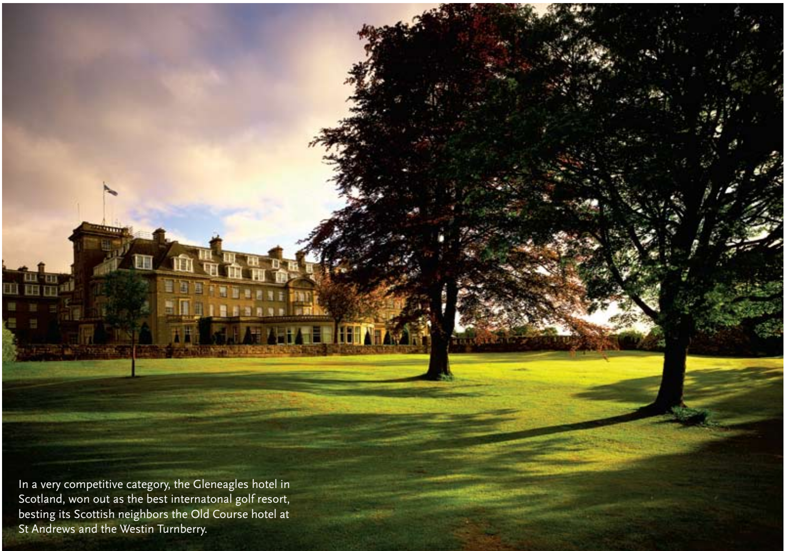
In a very competitive category, the Gleneagles hotel in Scotland, won out as the best international golf resort, besting its Scottish neighbors the Old Course hotel at St Andrews and the Westin Turnberry.