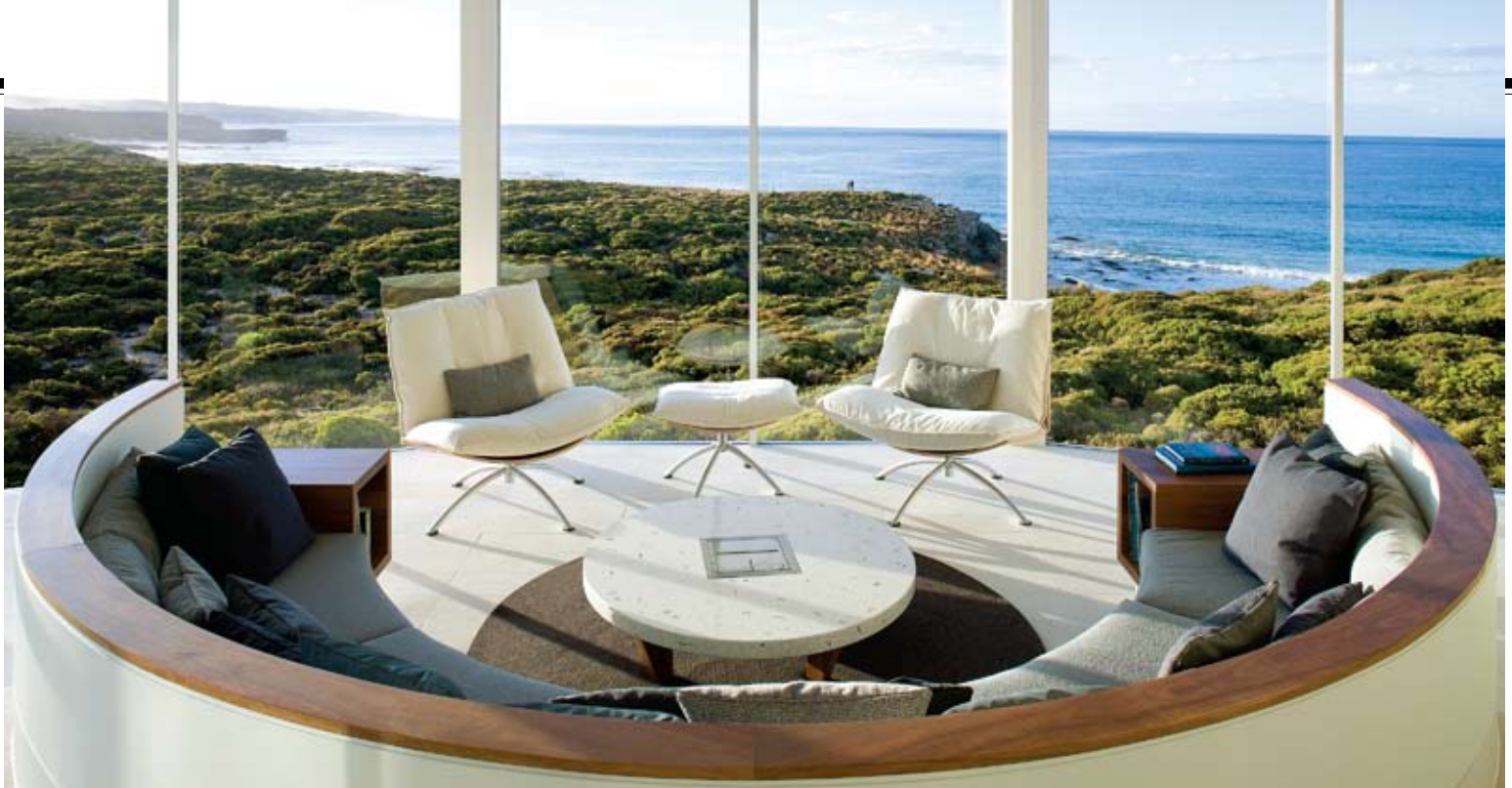
In far off Australia, the South Ocean Lodge, Kangaroo Island was cited for its astonishing glass walls and views, and the abundance of wildlife.