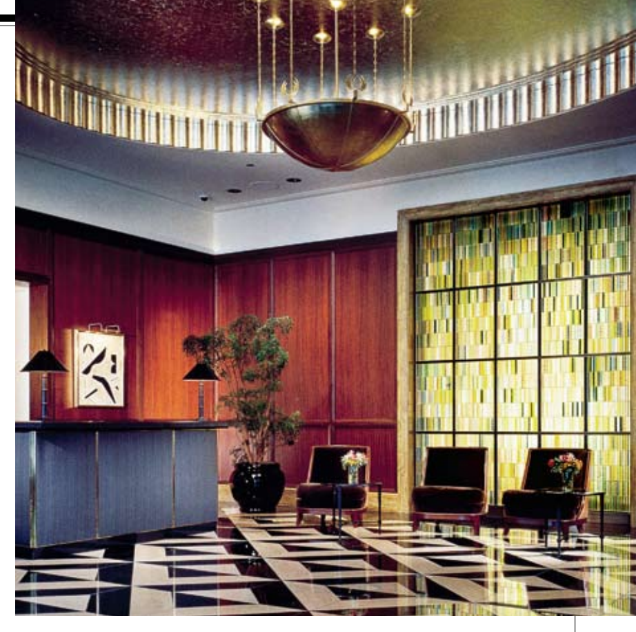
The Peninsula Chicago is praised for its Midwestern hospitality and European elegance in a big city setting.

Runner-up: The Greenwich, New York City. The Greenwich also boasts a guest-only bar, in an interior courtyard, along with a standout spa. "It's not easy to find many 'cool' hotels that offer 5-star service. I found