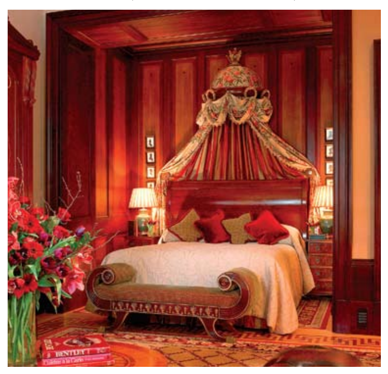
The Lanesborough, in London, has risen to the top of the moutain in a city filled with great hotels, and, it has a lounge for smoking cigars.

There is no doubt about it – Italy has the world's best hotels. Feltrinelli won our original poll, and this time tied with the Splendido, a spectacular property that has the best location in what many consider the most beautiful seaside town on earth, the pastel fantasy that is Portofino. If this is not enough, the Splendido also owns the best spot on the actual harbor, maintaining a satellite restaurant, where the front row seats coveted by passing throngs are reserved for hotel guests. In the case of the Grand Hotel a Villa Feltrinelli, set in Mussolini's former villa, be careful what