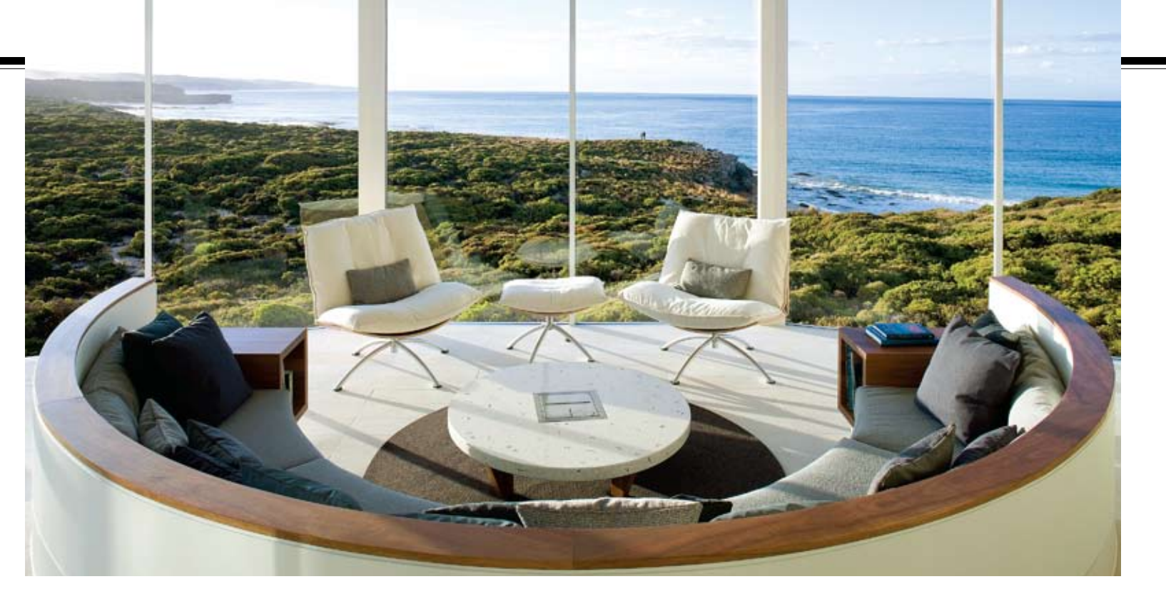
In far off Australia, the South Ocean Lodge, Kangaroo Island was cited for its astonishing glass walls and views, and the abundance of wildlife.