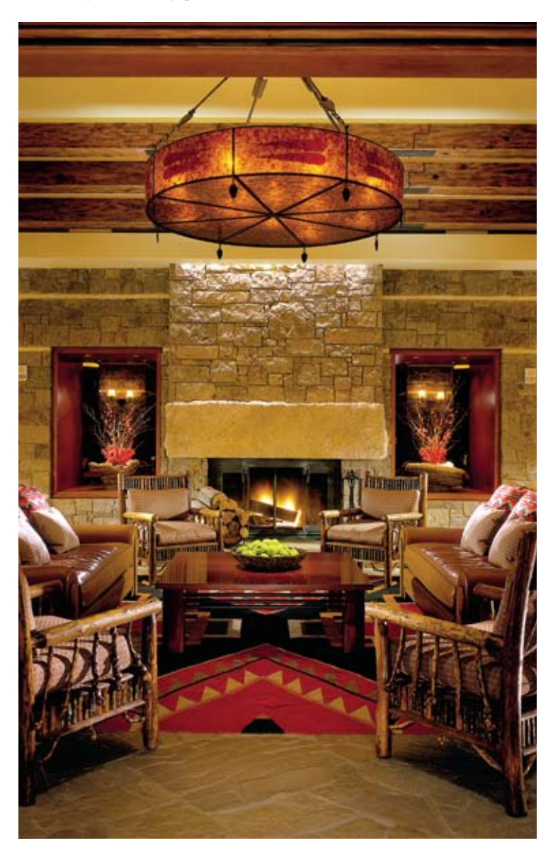
One of the newest developments in America has been the construction of top notch hotels in ski areas, like the Four Seasons Jackson Hole.

Favorites: Riffelalp Resort, Zermatt; Badrutt's Palace, St. Moritz; Omnia, Zermatt The Riffelalp's signature feature is stunning views of the Matterhorn from virtually everywhere on the property, but especially from the highest altitude outdoor pool in Europe, complete with jetted tubs and massage showers. The spa and gastronomy are first class as well. The Omnia won as Best New Ski Hotel in our previous poll, and also showcases the local icon, the Matterhorn, with floor to ceiling glass and modern architecture that led one panelist to describe it as "luxe lodgings more like something out of Singapore or South Beach than Switzerland." Badrutt's