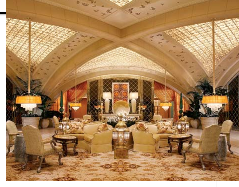
In a city where more new hotels have been built in the last 10 years than just about anywhere else in the world, the Wynn Encore leads the pack.

Notable Mention: Because New Zealand is much less urbanized, and tourists visit for nature's grandeur, votes were widely split amongst several smaller, far-flung properties worthy of mention: Kauri Cliffs; Cape